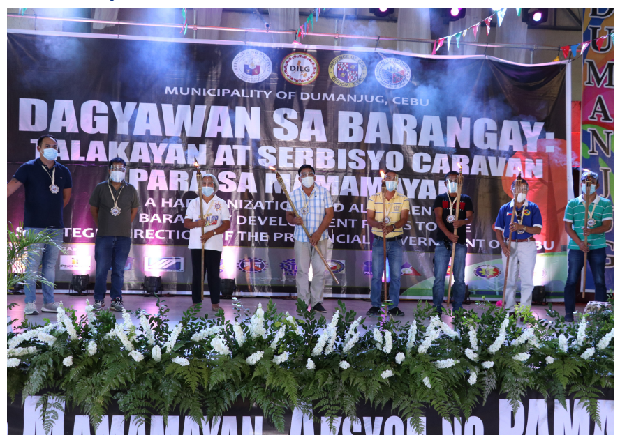
Punong Barangays from Bulak, Paculob, Panlaan, Tangil, Tubod-Bitoon, and Tubod-Dugoan light the “Torch of Hope to signify their unwavering commitment to attain lasting peace during the Dagyawan sa Barangay in Dumanjug, Cebu Province on October 16, 2020.

The Dagyawan sa Barangay aims to address socio-economic issues and concerns of the communities.