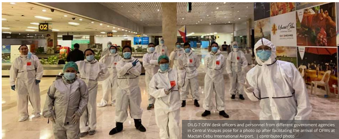
DILG-7 OFW desk officers and personnel from different government agencies in Central Visayas pose for a photo op after facilitating the arrival of OFWs at Mactan Cebu International Airport.

The digital newsletter is the commitment to continue the advocacies of KKK's Kalayaan newspaper, "Panata sa Kalayaan na May Puri at Kabanalan", a collaboration among The Freeman, Rizal-Blumentritt Pamantalaan Academy, and DILG-7