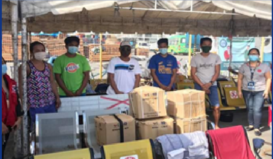
A group of LSIs assisted by DILG and DSWD desk officers at Pier 1.